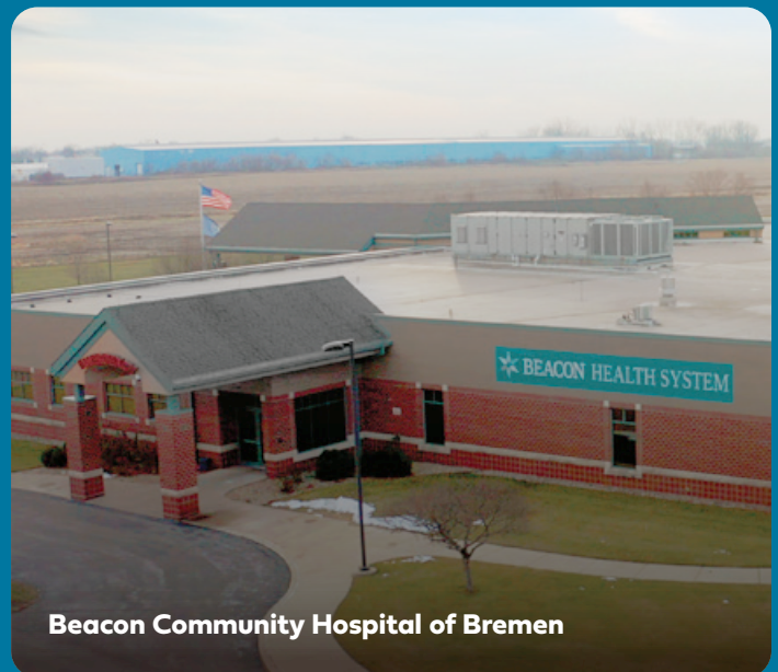
Beacon Community Hospital of Bremen