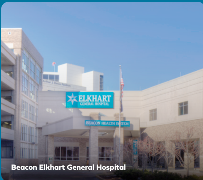
Beacon Elkhart General Hospital