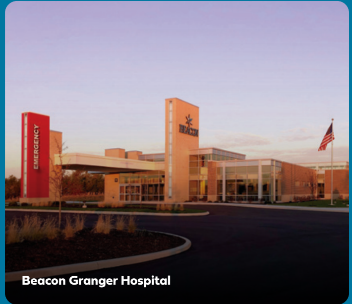
Beacon Granger Hospital