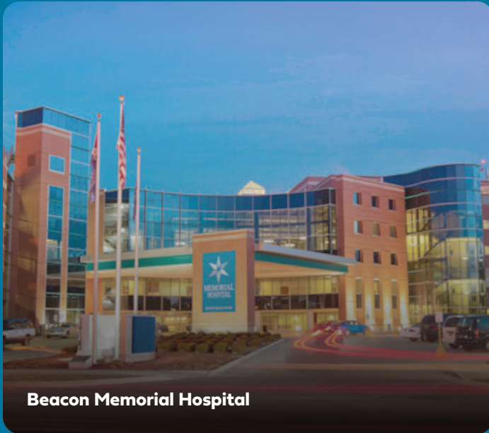
Beacon Memorial Hospital